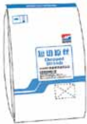
Composite plastic woven bags