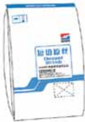
Composite plastic woven bags